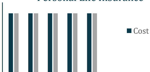
Personal Life Insurance